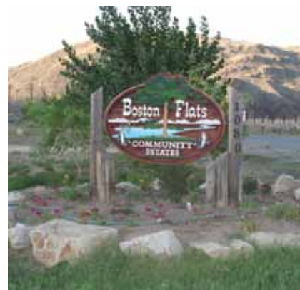
A nearby mobile home park still bears the name 'Boston Flats.'