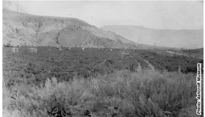
Tomatoes growing at Boston Flats.