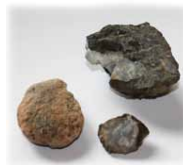
Agates found at Goldpan

The second type of rock is the ancient lava basalt that is exposed from Spences Bridge south to Nicoamen River. This rock is largely without topsoil or vegetation, laying