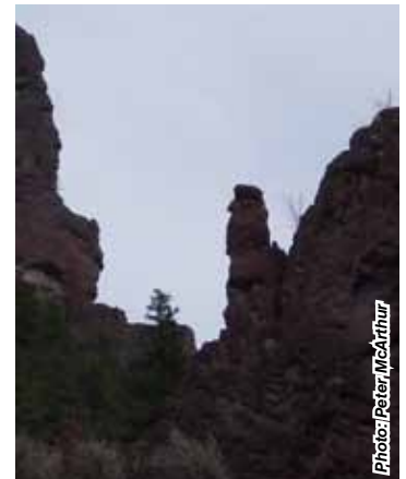
Rooster rock formation

Have your camera ready for bighorn sheep and bald eagle viewing, and there is Rainbow Canyon with its coloured bands of folded rock. Farm fresh peaches and tomatoes are available locally in season, and the vicinity is famous for its white water river rafting. Unexpected adventure waits at every turn.