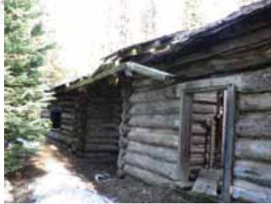
(right) A photo of how it appears today.